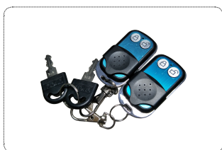
Remote control and keys