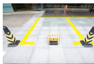
Private parking management